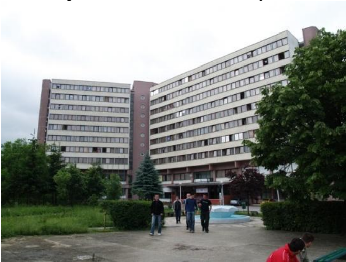
Student's dormitories Nedžarići - Sarajevo