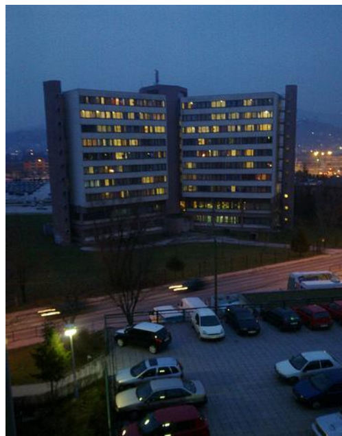
Student's dormitories Nedžarići - Sarajevo