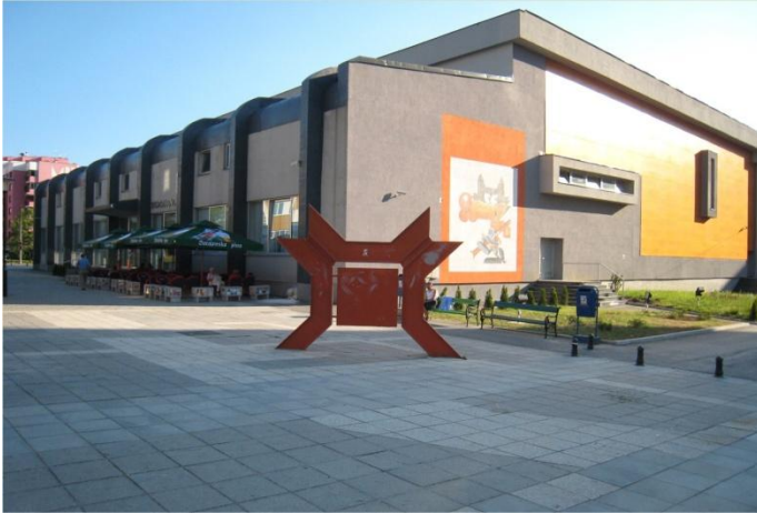
Sports Hall Ramiz Salčin, Sarajevo