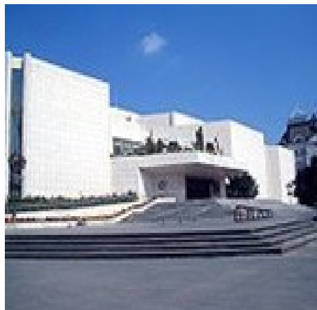
Novi Sad, Serbia, 2011